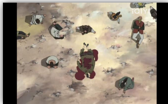
Figure 3. The Result of the Conflict

Figure 1.2 shows how there are two lines facing each other. These two groups of people are the one having conflicts with each other triggered by the evil woman seen in figure 1.1. The figure 1.1 was the beginning of the conflict. It is visible from the following discourse: