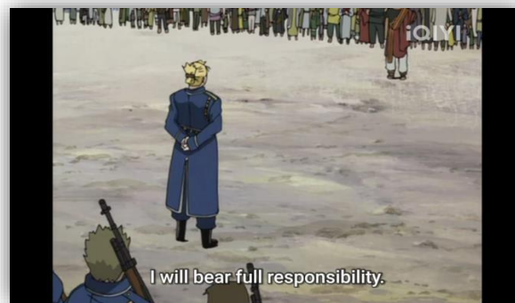
Figure 2. Lines of Ishvalan and The Military

The picture shows a woman in a scarf being in the Ishvalan line when there was a refugee checking by the military forces. This woman is seen to shoot the military forces that in the end creates a commotion of firings that kills many unarmed civilians. Moreover, she was helped by her friend to shout hate words to trigger people's anger and hate. The picture below shows the scene where the military were attacking back at the civilians, not knowing that the culprit is the woman in the scarf who did not belong to the Ishvalan group.