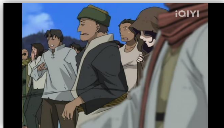
Figure 1. The Evil Woman Starting the Conflict

Catharsis is one good way to insert the idea that Israel must be supported because they were the oppressed in the Holocaust. It should be understood that a literary work such as movies or animes are delicate work that requires a lot of support from many kinds of people. The animation, story, music, sales manager, and many other works behind the success of the literary work is evidence enough to say that the story is intentionally made up. In this term, this anime is intentionally made to give clear representation that Israel needs to be supported.